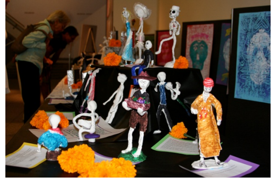
La Cuesta Continuation High School students' altar in honor of family and friends.

The Day of the Dead is traditionally celebrated by creating altars or “ofrendas” (offerings) that include portraits, personal goods, clothing, favorite foods, and possessions of the deceased family member. This is an important social ritual that symbolizes the cycle of life and death that is human existence. SBMA’s display of altars are created by various partner schools and community organizations including La Cuesta Continuation High School , SB Public Library Eastside Branch , Our Lady of Mount Carmel School, Montecito Union School, Carpinteria Middle School, and Crane School; students enrolled in the Museum’s after-school outreach programs, Homework/Artwork After-School ; Art After School in collaboration with the Police Activities League and A-OK After-School at Adams Elementary; and Brandon Elementary and El Camino Elementary, which receive the Museum’s in-classroom outreach program ArtReach. Each group has incorporated traditional symbols and iconography to offer thanks to departed family, friends, or artists in the Museum’s collection for their help in guiding, inspiring, and protecting those who remain on earth.