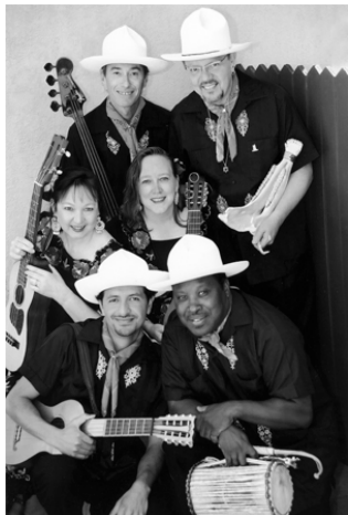
Conjunto Jardin returns to SBMA’s Día de los Muertos celebration for the second year in a row.

Limited edition t-shirts and tote bags, with original, stenciled designs created by La Cuesta Continuation High School student artists , are also on sale as part of the celebration. The sale proceeds go toward the La Cuesta Art Scholarship, which will be awarded to a graduating senior at the 2015 commencement. The Santa Barbara Museum of Art and La Cuesta Continuation High School have been collaborating since 2007, providing opportunities for students to explore forms of self-expression through art and language. Previous projects have been exhibited in the Museum Shop window and SBMA elevator, at the Ridley-Tree Education Center at McCormick House, and at a number of Free Family Days.