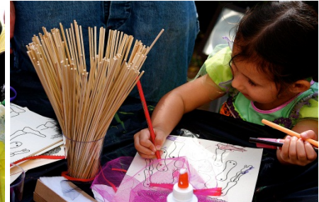
From left to right: Hand-made calaveras piece from student altars, Group photo of members of Quetzalcoatl, Art activities inspired by Día de los Muertos