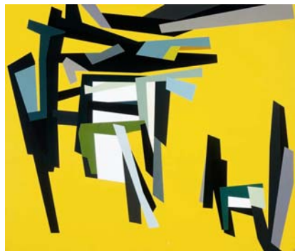
Karl Benjamin, ES #1 , 1961. Oil on canvas. Santa Barbara Museum of Art, Museum Purchase

Contact: Katrina Carl (805) 884-6430 kcarl@sbma.net