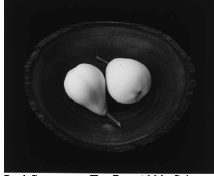
Paul Caponigro, Two Pears 1999. Gelatin silver print.

A lifelong gatherer of fragments and traces - humble seeds and shells, rocks and stones, leaves, fruits, and flowers—he listens in silence and simply lets the objects speak. These objects fill Caponigro’s home, companions in his quotidian reality along with his grand piano.