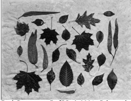
Paul Caponigro, Leaf Mosaic 2001. Gelatin silver print.