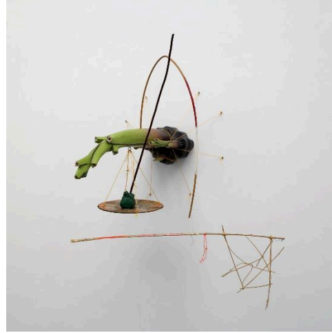
Left: Elliott Hundley, Tiered Sounds (detail), 2017. Paper, oil, fabric, pins, plastic, glass, shells, lotus pods, metal, foam and linen on panel. Private collection, Santa Barbara, CA. Right: Elliott Hundley, Constellation with the Mysterious Object , 2008. Painted wood, string, bamboo, Masonite, paper, wire, floral putty, screws, eye screw.

The desire to remove the barriers between audience and art is especially relevant to objects from more than two thousand years ago presented utterly out of context in a museum behind glass. Hundley shares, "I've always wanted to do something with antiquity because these objects are so rarefied. But the more I learn about them...one of the things that I see is that they have lost their intimacy. I have always aimed to do that in my work and included classical themes and images, but this [installation] is a way to do that even more directly." James Glisson, SBMA Chief Curator and Curator of Contemporary Art, shares, "We immediately started talking about how to reconnect with these ancient objects as things that were used and handled before they entered the Museum with its clean-room methods of handling and displaying artworks." Hundley encouraged SBMA's installation team to present the ancient Roman glass in a safe but completely untraditional way. As if in a window display at a department store, contemporary commercial perfume bottles will be mixed with ancient ones held aloft by plant-like