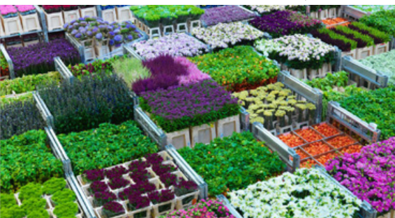
Flora Holland Auction House, Aalsmeer

Disembark this morning and transfer to Schiphol Airport for flights home or join the post-tour extension in Amsterdam. (B)