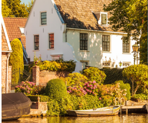
Vecht River Historic Home