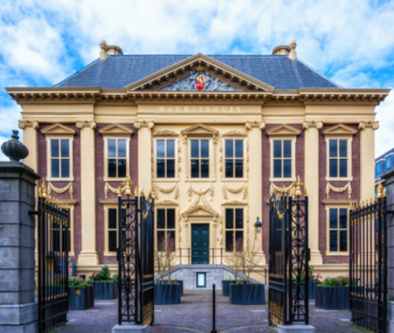
Mauritshuis Museum, Den Haag

Rococo manor and the oldest landscape garden in South Holland. Return to the barge in Gouda for an optional bike excursion before dinner on board.