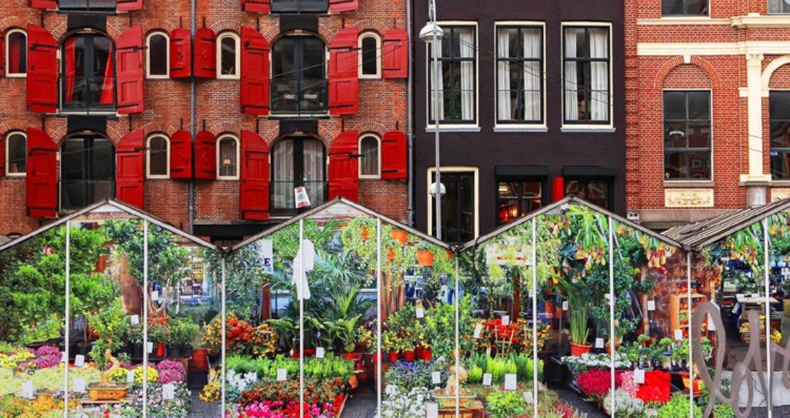
Bloemen Market, Amsterdam