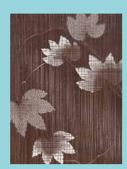
Carved Paper: The Art of the Japanese Stencil

Sculpt the head of Diana, the ancient Greco-Roman goddess of the hunt and moon, or Venus, the goddess of love and beauty, in air-dry terracotta clay.