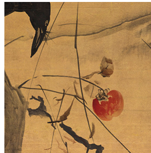
A persimmon being watched by a nearby crow