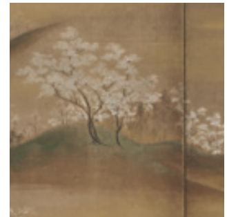
Cherry blossoms on a hillside