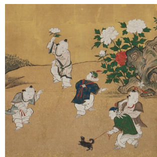
Children at play, walking a dog