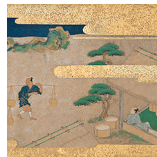
Baskets of salt