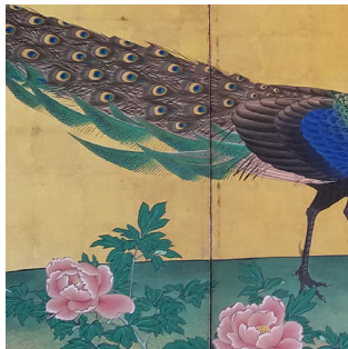
Two proud peacocks

Go on a scavenger hunt to find the items below, using the image details as your guide. When you have found all these things, return to the Visitor Services desk to claim your prize. With it, you can design your own miniature screen at home to help you remember your visit today. What season, animal, tree, or story will you include?